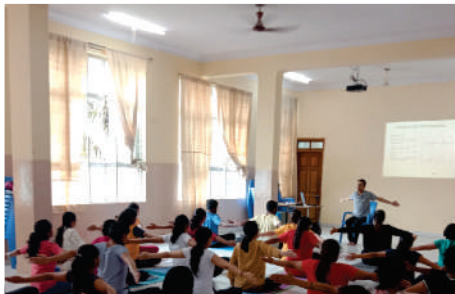
Yoga and Wellness