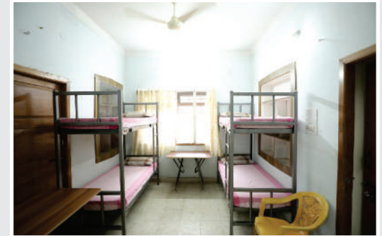
Four sharing room