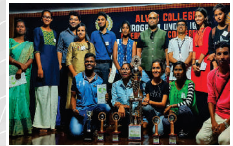
KAPMI students participated in Alva's Fest