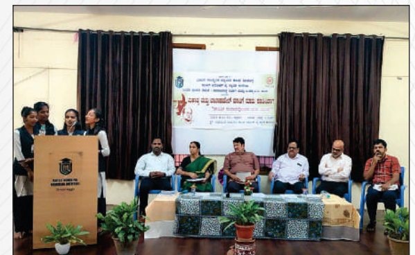
Workshop on Gandhi and BR Ambedkar