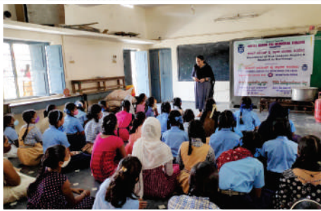
Menstrual hygiene programme for School students