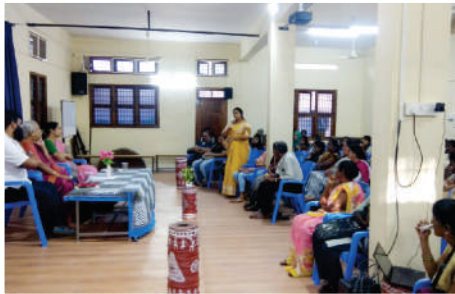
Yashodepa-Parents Meeting Cell