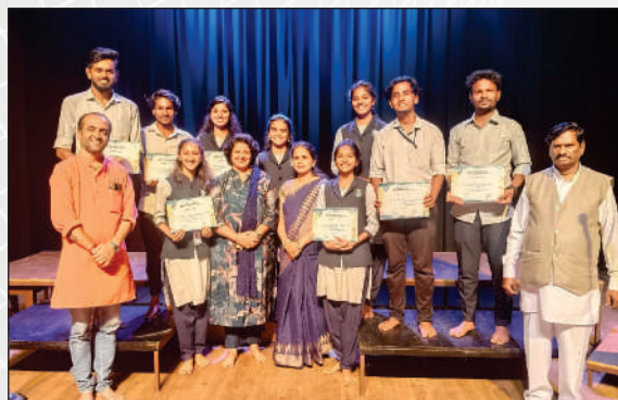
Theatre workshop at Rangayana