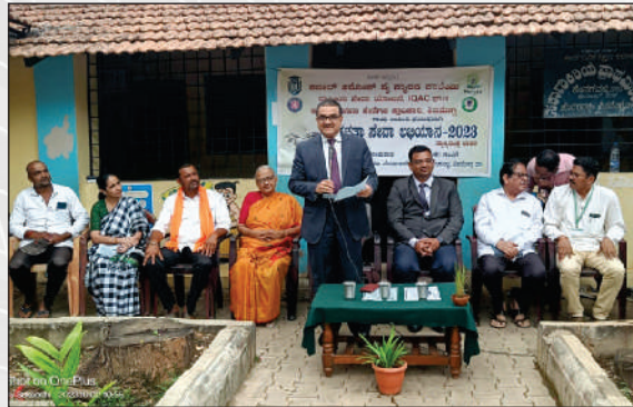
Community Outreach Programme at Sevalal Nagar