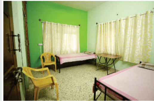
Two sharing room