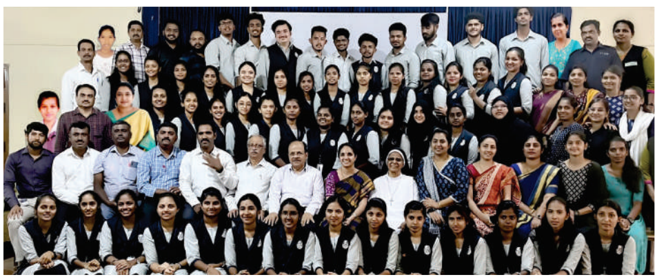
2022-23 Final Year Students of KAPMI

- ಎಸ್. ನಾಗತಿಹಳ್ಳಿ ಚಂದ್ರಶೇಖರ್, ಚಲನಚಿತ್ರ ನಿರ್ದೇಶಕರು