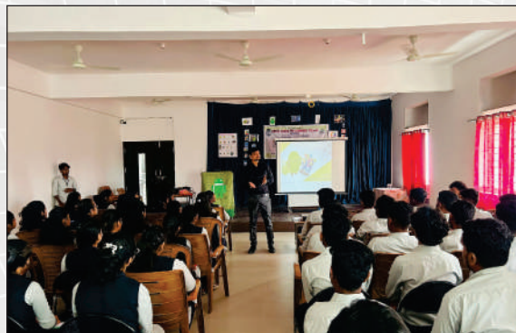
Inauguration of BCA club