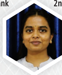
Jhansi G P