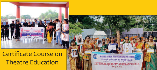
Certificate Course on Theatre Education