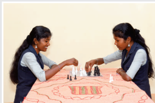
Indoor sports & games