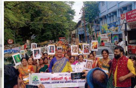
"Naari Nadige" with Manjamma Jogathi