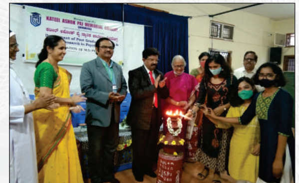
The VC and Registrar inaugurating PG Department