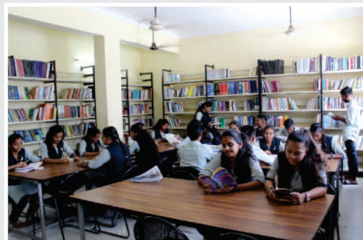
Library with access to books, journals & E-materials