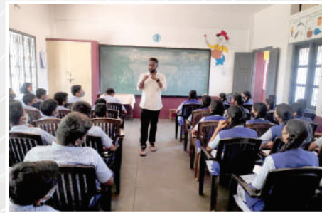
Rural Awareness programme on mobile addiction