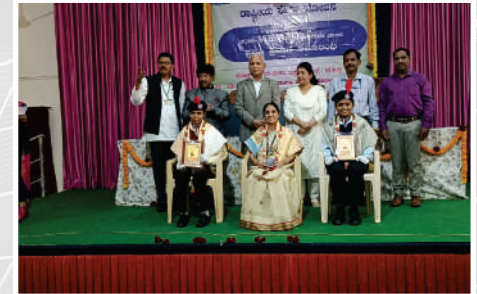
NSS State Award