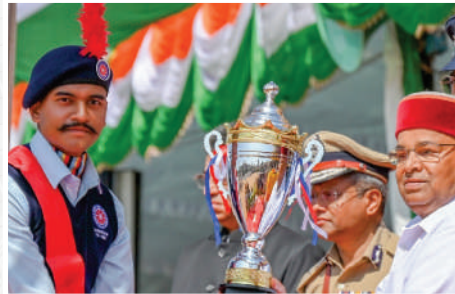
NSS Team secured 2nd prize in State Republic Day Parade-2024