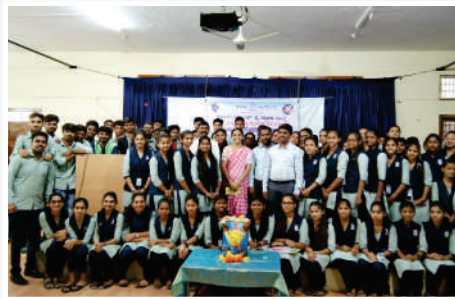
Youth Day celebrated by the NSS Unit